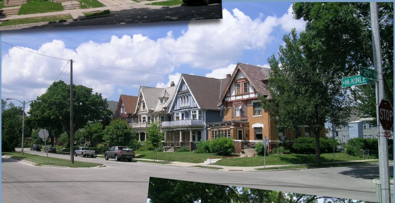
Today's neighborhood- Row of duplexes at 29th & McKinley