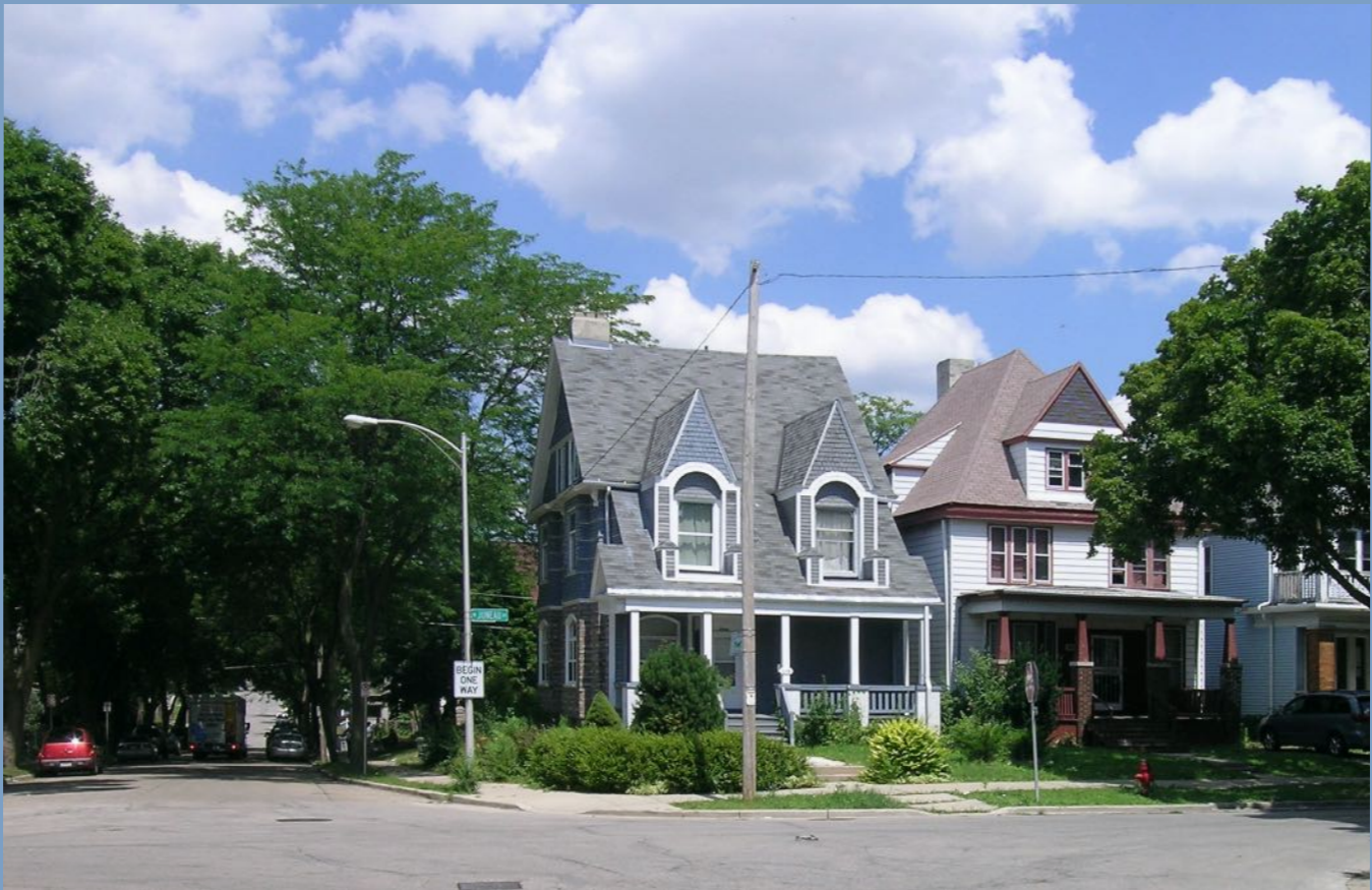
Today's neighborhood-Houses on 33rd & Juneau