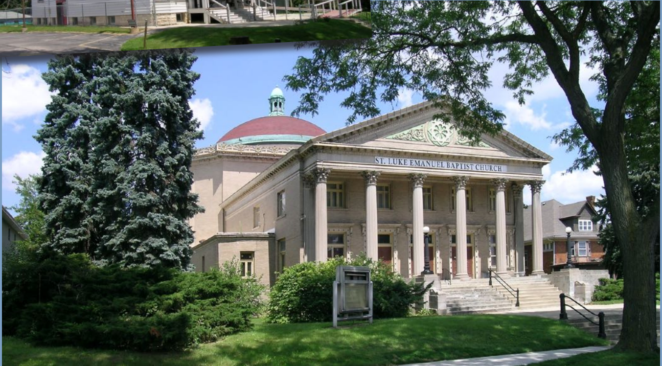
Today's neighborhood-St. Luke Emanuel Baptist Church at 27th & W. Highland Blvd.