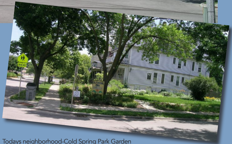
Today's neighborhood-Cold Spring Park Garden