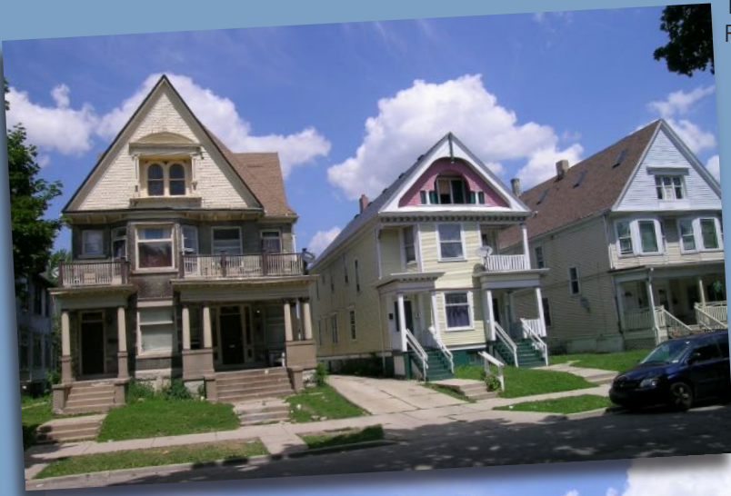
Today's neighborhood- Row of duplexes at 30th & Juneau